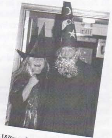
Wizard & Witch