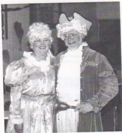
The Town Crier & a Guy with a Bell