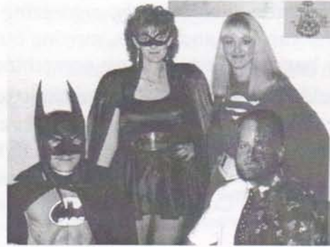
Super Heros and... half monster guy