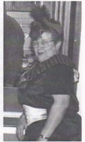
Hi sailor, new in town?