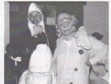
A costume with appeal