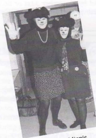
Mickey & Minnie