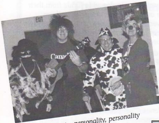
We got... personality, personality