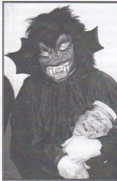
The scariest of all