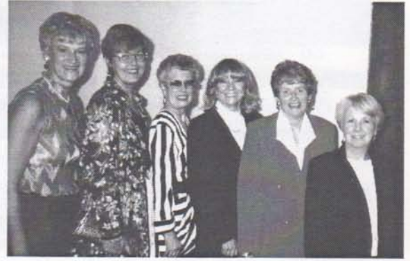
No jokes, just six of our lovely ladies. (but,they do clean up real good!)