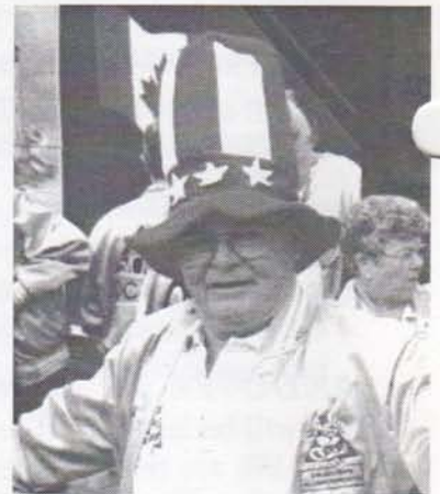
DCAT in the hat