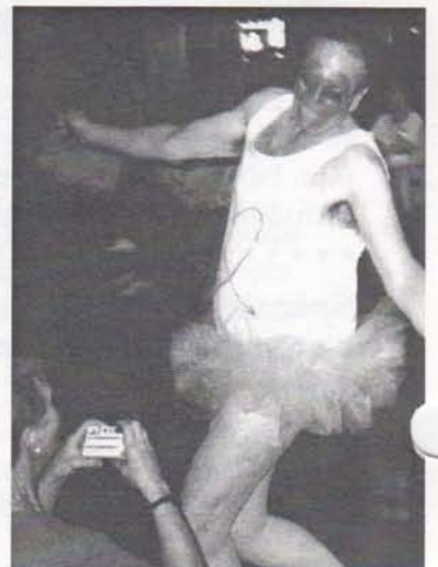
Party, Party, Party!