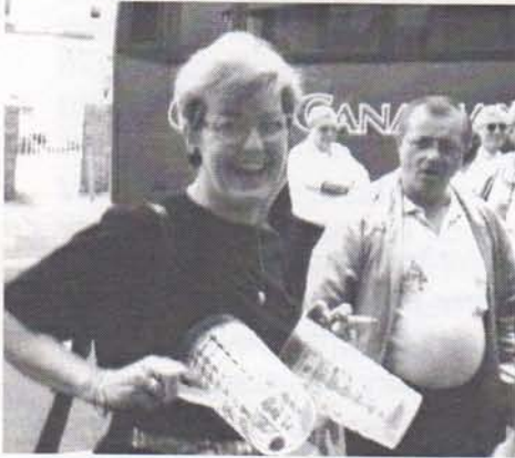
There not pitchers, they're jugs!