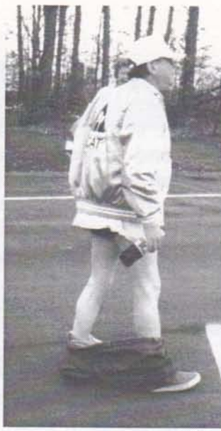
Stanley, you've got some 'splaining to do!