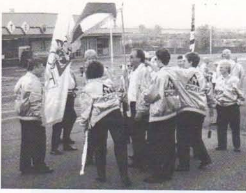
Parade formation.. lead, follow, get the hell out of the way!