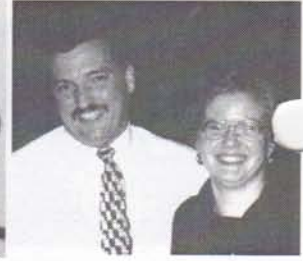
Aggie didn't have all the fun!