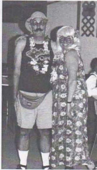
The Odd Couple