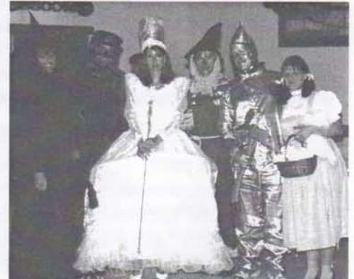
Somewhere over the Rainbow