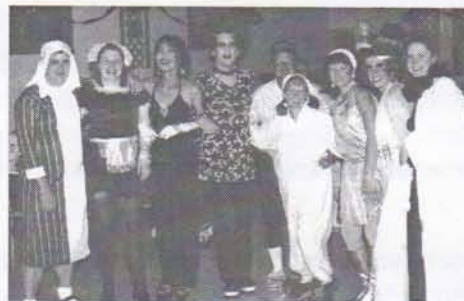
Why is everybody looking at me?