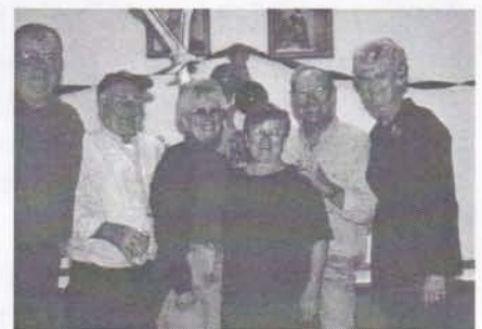
The Social Committee/Decorating Group