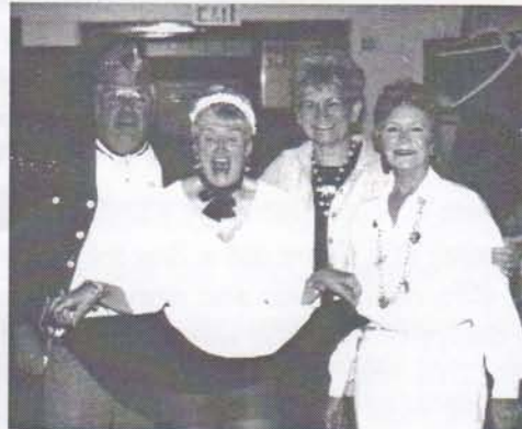
The upstairs maid shows her stuff