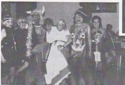
The Wild Bunch