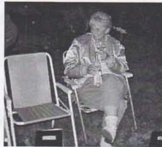
Join me won't you!