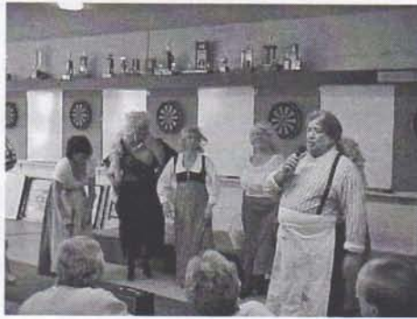
Master of the House