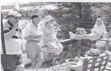
Sittin' in the sun