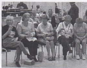
Enjoying the brown bag cuisine