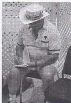
Picking the ponies