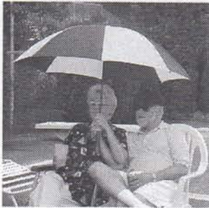
Damn sun was so hot!