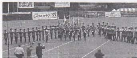
Toronto Signals Trumpet Band, that's me carrying a flag.