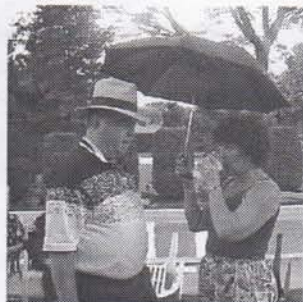
Ok! So it rained.