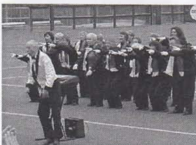
DCAT Chorus on the field