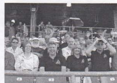
Cheering on the Alumni Corps