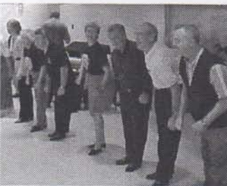
The dance line, line dance