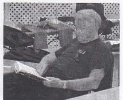
Bookworm killing time