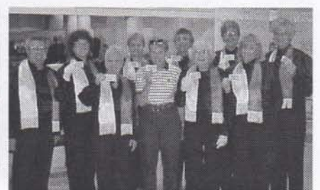
The DCAT 10 (minus 1)