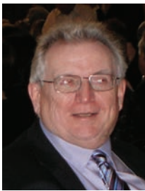
President John Dickinson